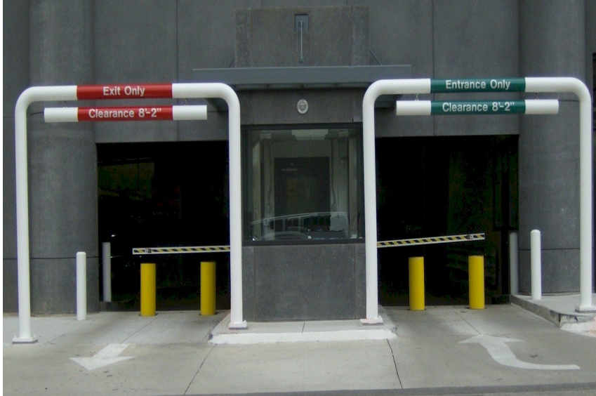
Model B-30 Bollard System

Arranged independently or as a set, the Model B-30 Bollard System incorporates dual speeds. Normal operation, which is site adjustable, and emergency fast operation (less than 1 second) for when immediate deterrence is required. The bollards also feature multiple operating methods including card reader activation, push button control, and vehicle detection to suit the characteristics of any operation.