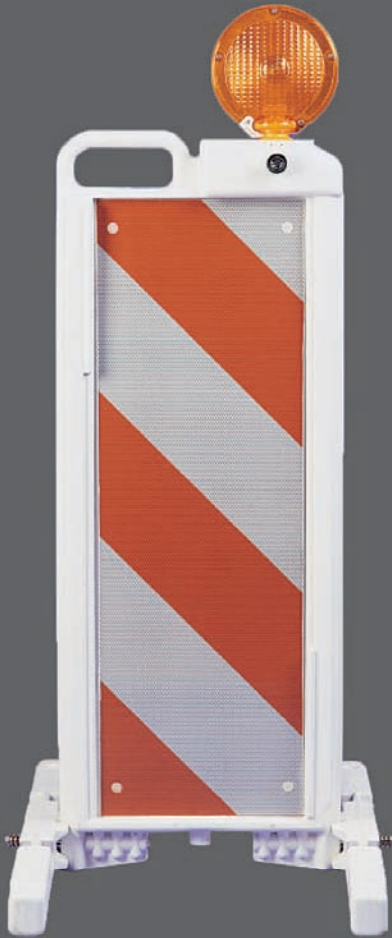
12'W x 36'H Sheeting Panel

Narrow design is perfect for tight configurations