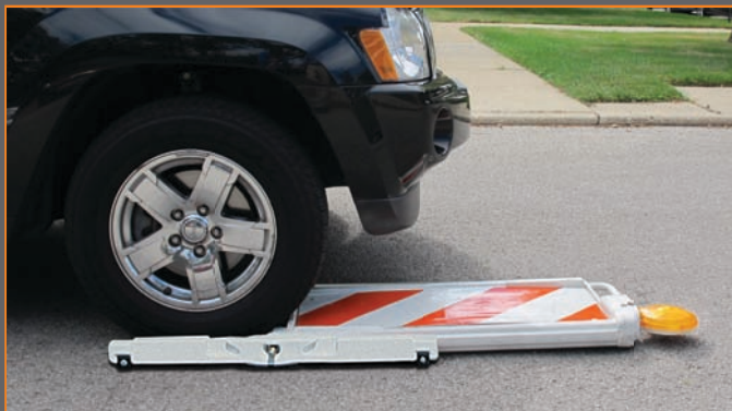
Lies flat when hit, reducing damage to unit and vehicle