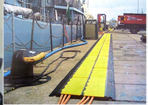
PICTURED: YJ5-125 IN USE)

Checkers' Linebacker Cable Management offers the most extensive line of high performance cable/hose protection products in the world. These durable cable protection systems provide a safer method of passage for pedestrian traffic, vehicles and heavy duty equipment while protecting valuable electrical cables, cords and hose lines from damage.