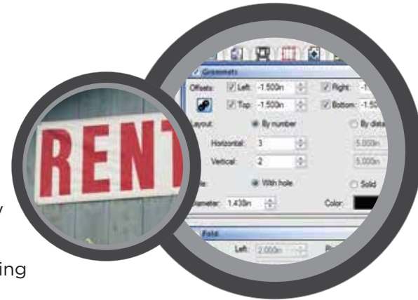
Banner & Canvas Finishing Tools