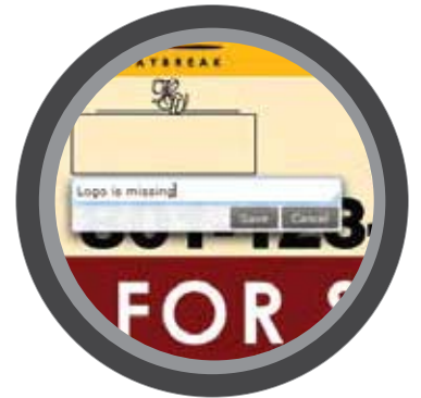
Automated Artwork Approval Tool