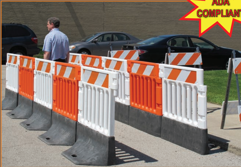
Create a temporary pedestrian walkway

ADA Compliant Pedestrian Barricade Longitudinal Channelizing Device