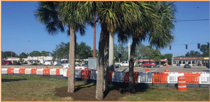
Longitudinal Channelizing Device Use on Roadways Instead of Traffic Barrels