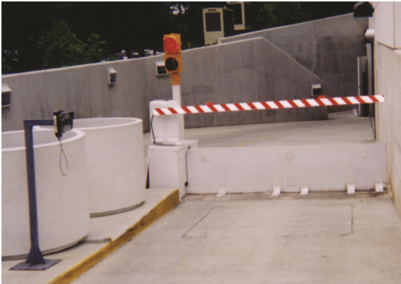
Model 890 Surface Mount Barrier

In the active (up) position, the barrier stands 24 inches (61.0 cm) high and lowers to the ground to allow authorized vehicles to pass. The standard barricade plate is 9 feet (2.7 m) wide but may be customized to sizes up to 14 feet (4.3 m).