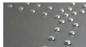
Individual Protective Lenses Close-up View of Sign Digit