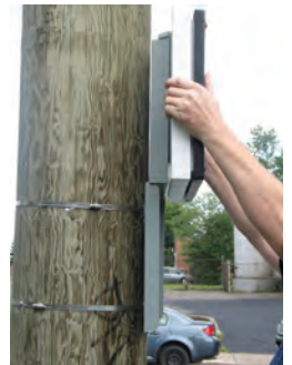
Universal mounting bracket

Folding Sign Plate: Sign is available with smaller "Your Speed" sign plate that folds compactly for convenient relocation.