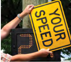
Folding Sign Plate

Battery Power: Lithium ion batteries offers extended operation with choice of 9.6V, 10Ah battery for two week performance or 12.8V, 15Ah battery for four week performance before recharge under normal operating conditions.